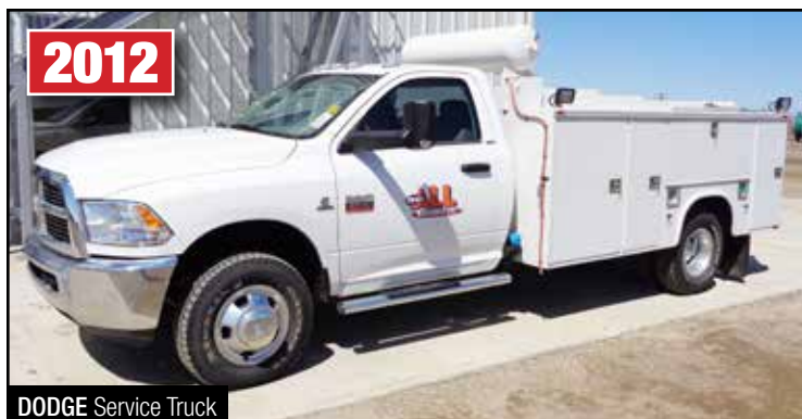
DODGE Service Truck