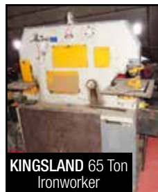
KINGSLAND 65 Ton Ironworker