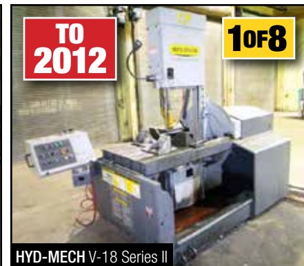
HYD-MECH V-18 Series II