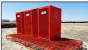
Several Fuel Cases