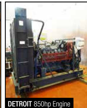
DETROIT 850hp Engine