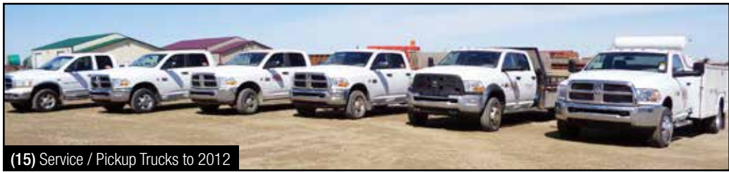
(15) Service / Pickup Trucks to 2012