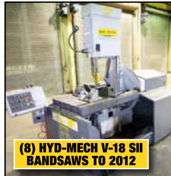
(8) HYD-MECH V-18 SII BANDSAWS TO 2012