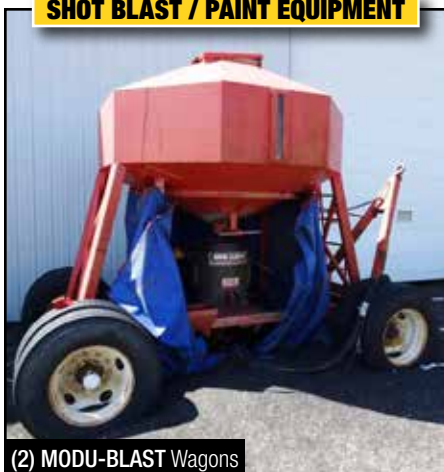
(2) MODU-BLAST Wagons