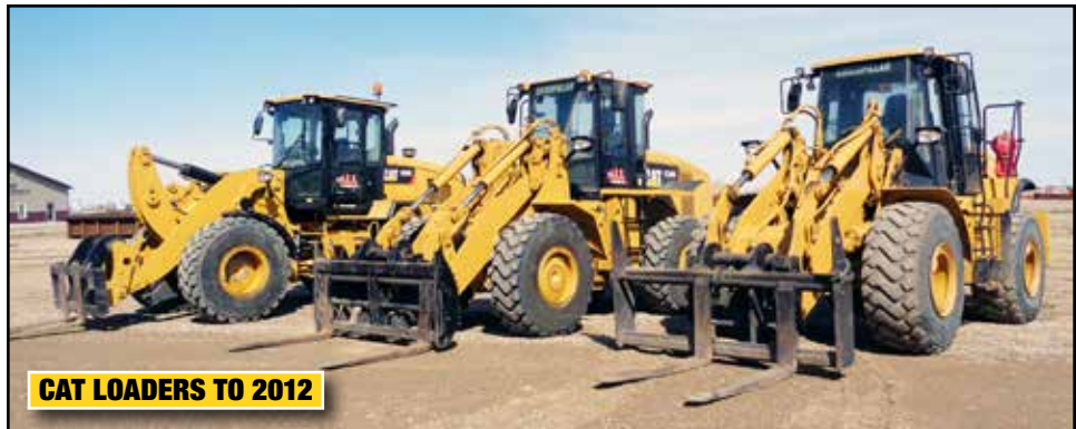
CAT LOADERS TO 2012