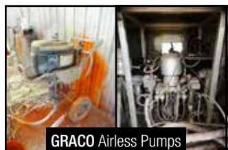
GRACO Airless Pumps