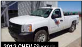
2012 CHEV Silverado