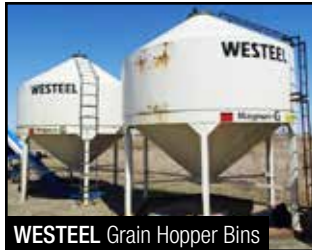
WESTEEL Grain Hopper Bins