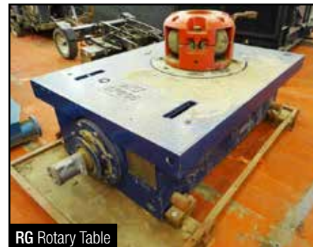
RG Rotary Table