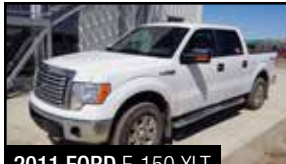
2011 FORD F-150 XLT