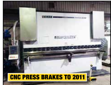
CNC PRESS BRAKES TO 2011