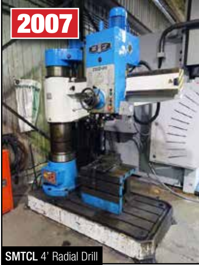
SMTCL 4' Radial Drill