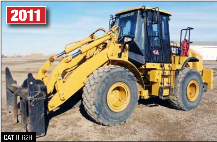
CAT IT 62H