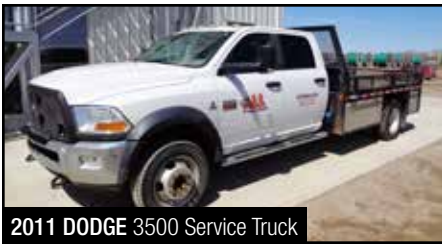
2011 DODGE 3500 Service Truck