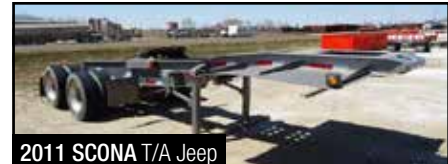
2011 SCONA T/A Jeep