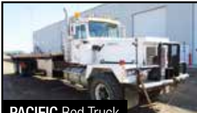
PACIFIC Bed Truck