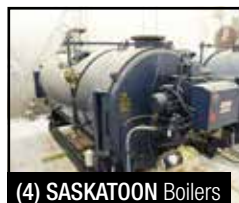
(4) SASKATOON Boilers