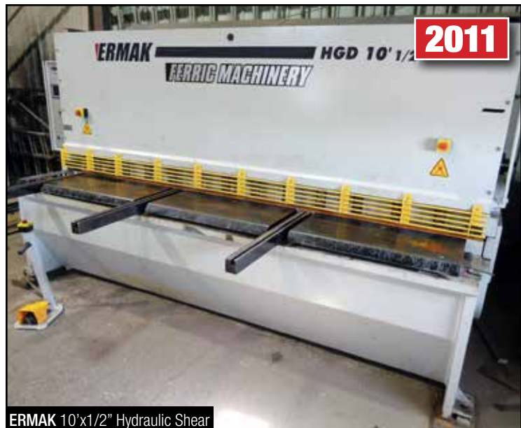
ERMAK 10'x1/2" Hydraulic Shear