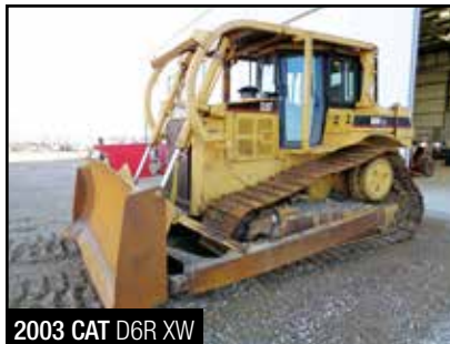
2003 CAT D6R XW