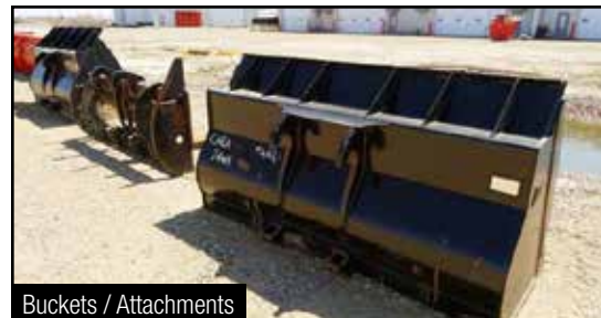
Buckets / Attachments