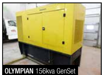
OLYMPIAN 156kva GenSet