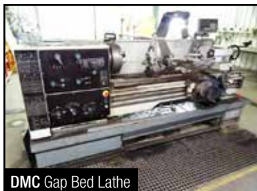
DMC Gap Bed Lathe