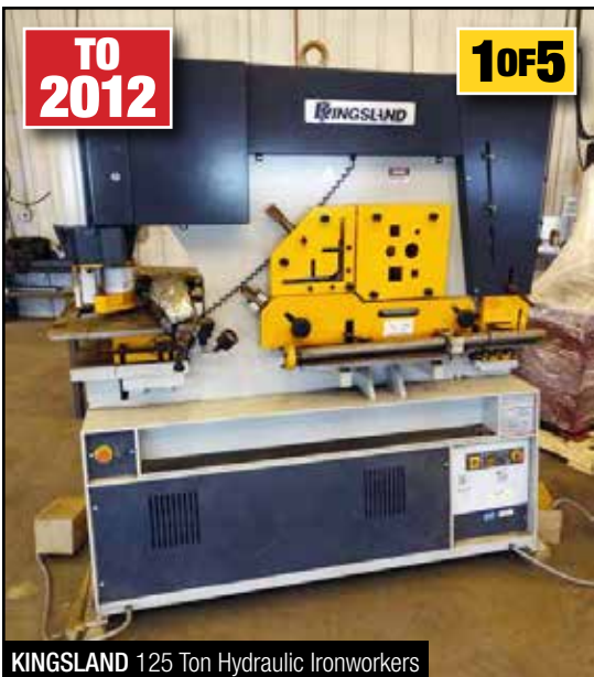
KINGSLAND 125 Ton Hydraulic Ironworkers