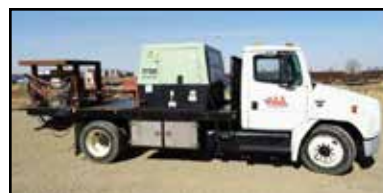
FREIGHTLINER / FORD Sandblast Trucks