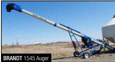
BRANDT 1545 Auger