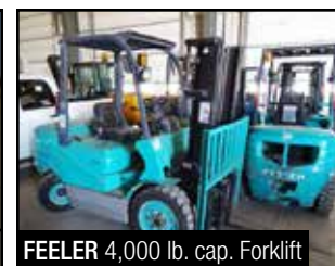
FEELER 4,000 lb. cap. Forklift