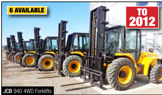
JCB 940 4WD Forklifts