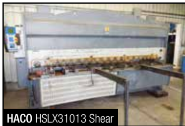
HACO HSLX31013 Shear