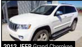
2012 JEEP Grand Cherokee