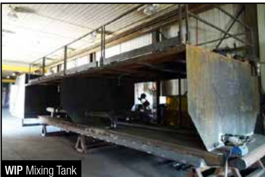
WIP Mixing Tank