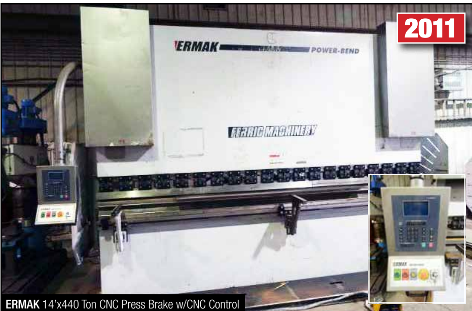
ERMAK 14'x440 Ton CNC Press Brake w/CNC Control