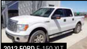
2012 FORD F-150 XLT