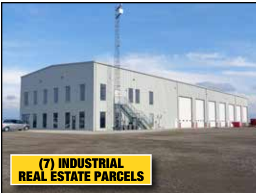
(7) INDUSTRIAL REAL ESTATE PARCELS