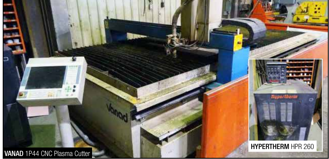
VANAD 1P44 CNC Plasma Cutter