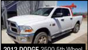
2012 DODGE 3500 5th Wheel