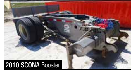
2010 SCONA Booster