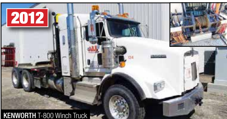
KENWORTH T-800 Winch Truck