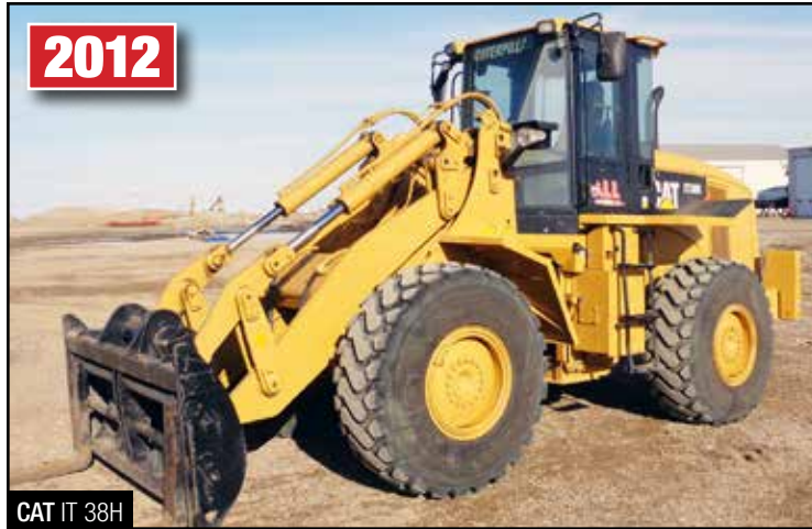
CAT IT 38H