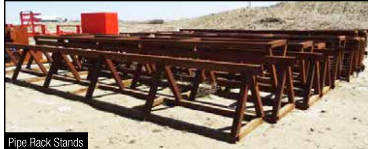
Pipe Rack Stands