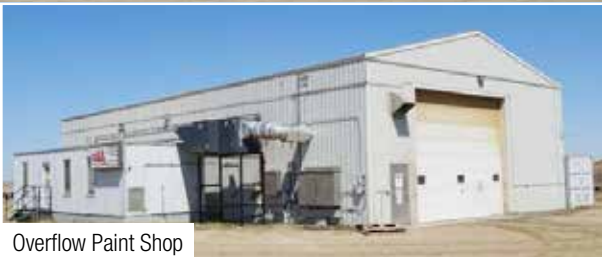
Overflow Paint Shop