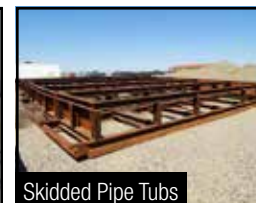
Skidded Pipe Tubs