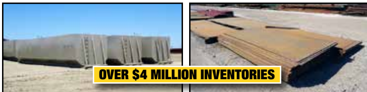
OVER $4 MILLION INVENTORIES