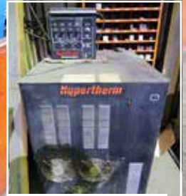
HYPERTHERM HPR 260