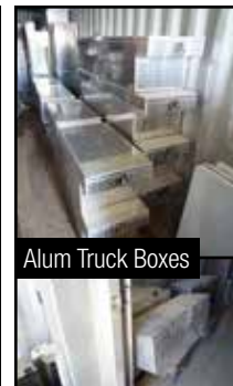
Alum Truck Boxes