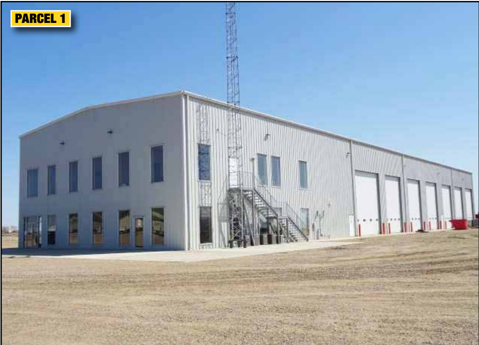
As New 16,000 Sq. Ft. Shop - Main Office Building w/(14) Overhead Doors & (3) Kone OH Cranes