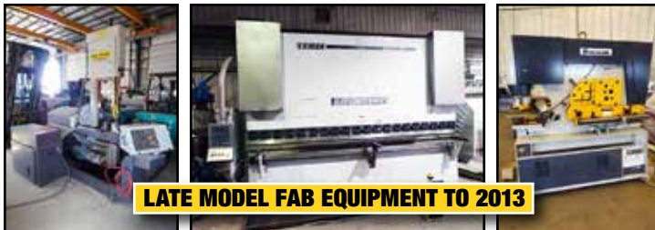
LATE MODEL FAB EQUIPMENT TO 2013