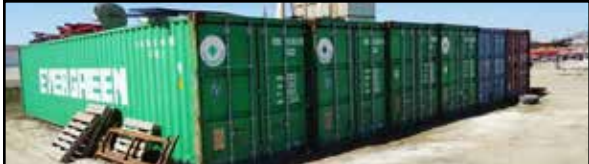
40' / 20' Sea Containers