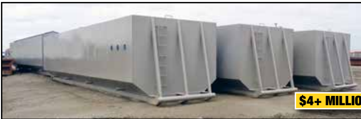
$4+ MILLION INVENTORY