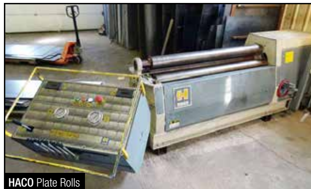
HACO Plate Rolls