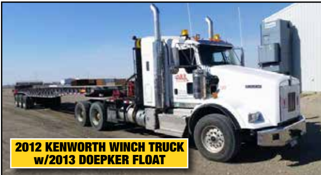
2012 KENWORTH WINCH TRUCK w/2013 DOEPKER FLOAT