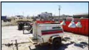
AMIDA Light Trailer