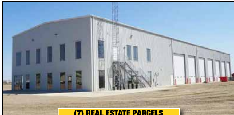
(7) REAL ESTATE PARCELS AVAILABLE FOR IMMEDIATE SALE